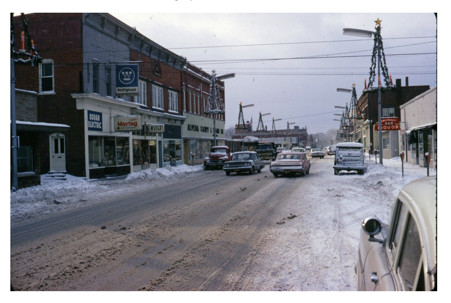
Exhibit D- Historic Photos of Property